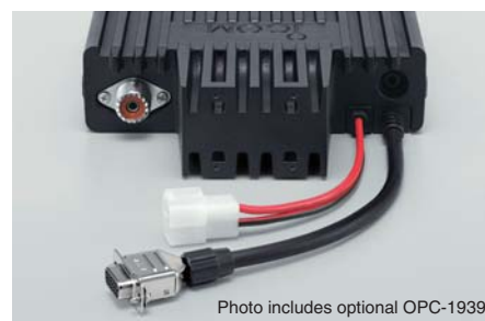
Photo includes optional OPC-1939

With the optional OPC-1939 D-SUB 15-pin ACC cable, the IC-F5023/H series can be programmed to control an operating channel from an external device (up to 16 preprogrammed channels). The ACC connector also provides an ignition sensing function, external PTT, PC command, horn honk, audio output and modulated signal input depending on programming.